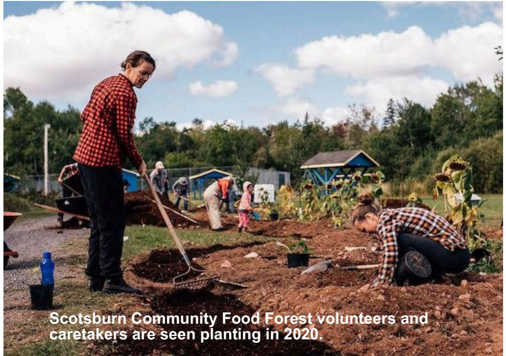
Scotsburn Community Food Forest volunteers and caretakers are seen planting in 2020.

"It's a wonderful opportunity for our community to come together, enjoy delicious local foods grown right here, and support our efforts to promote food security, food literacy and community resiliency."