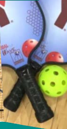
YMCA of Pictou County – Why we are involved in RJPC Project