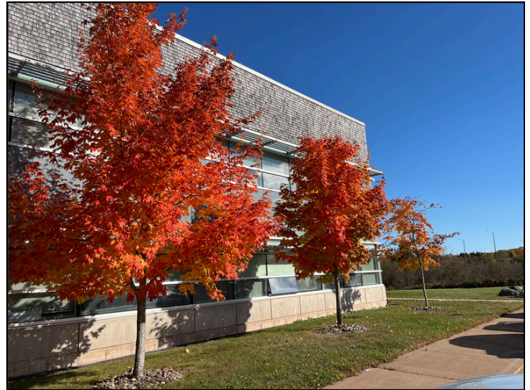
Some trees showing beautiful fall colours outside the MOPC Administrative Building.