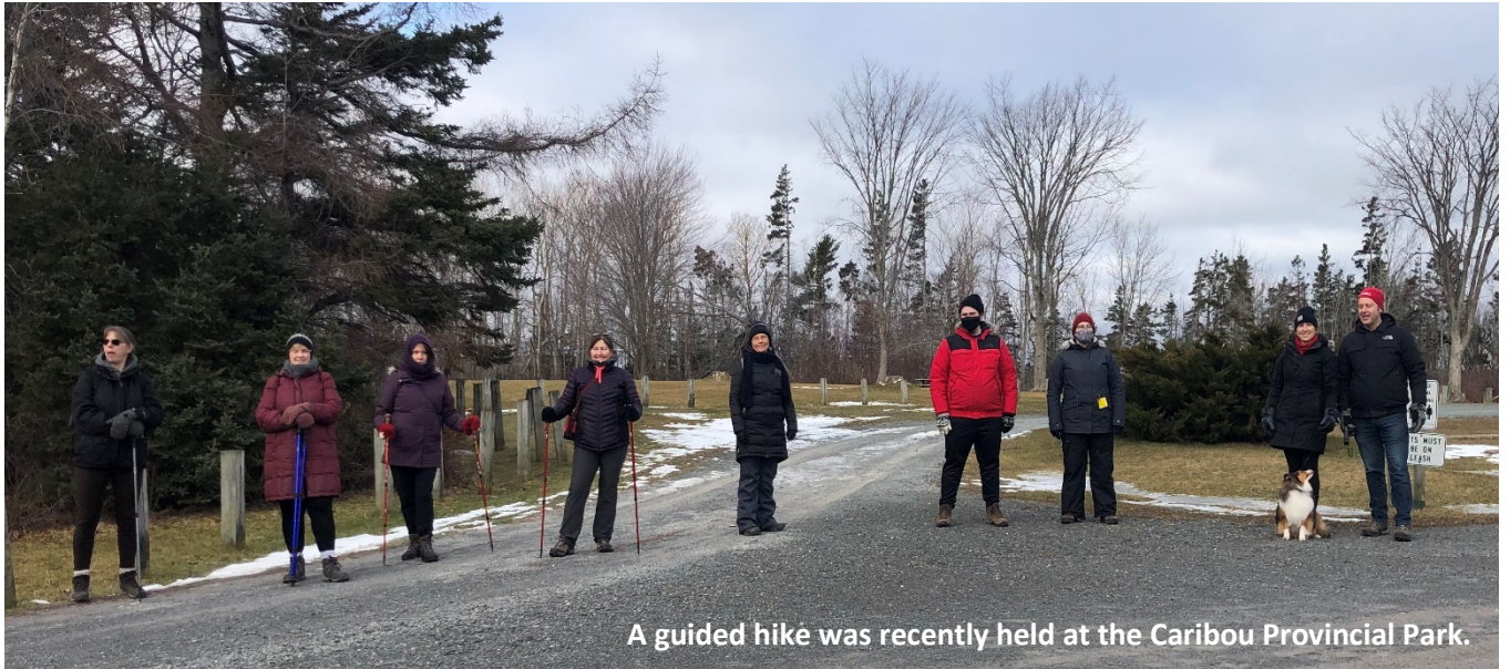
A guided hike was recently held at the Caribou Provincial Park.

46 Municipal Drive, Pictou, Nova Scotia - Winter 2021