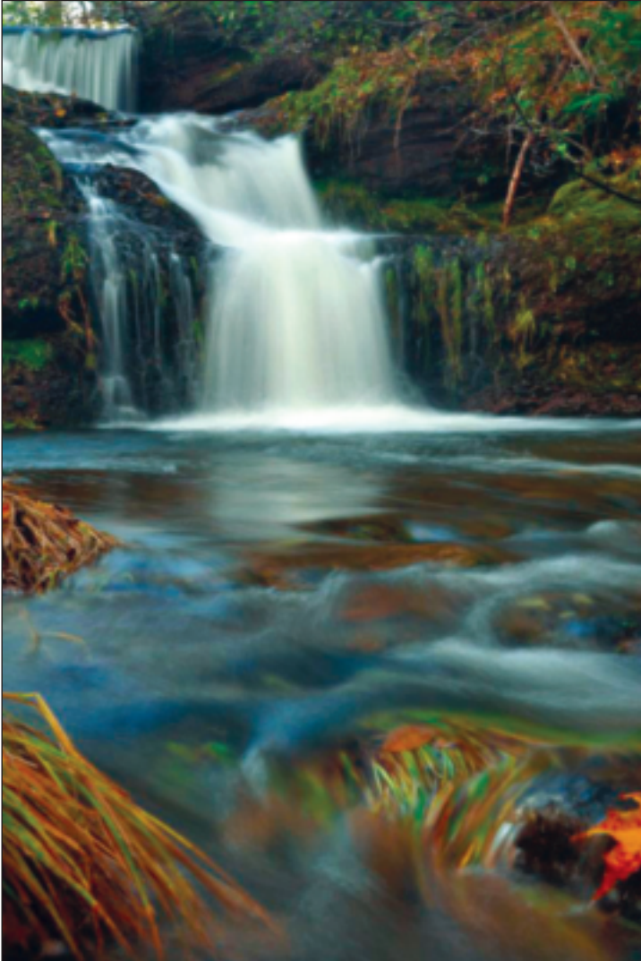
Falls near Scotsburn